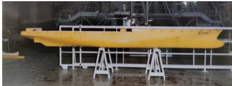
Figure 1: The hull model 2054.